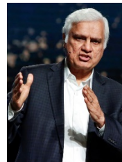
Ravi Zacharias Christian Apologist 1946-2020