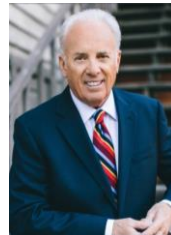
John MacArthur Pastor / Author