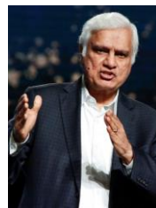
Ravi Zacharias Christian Apologist